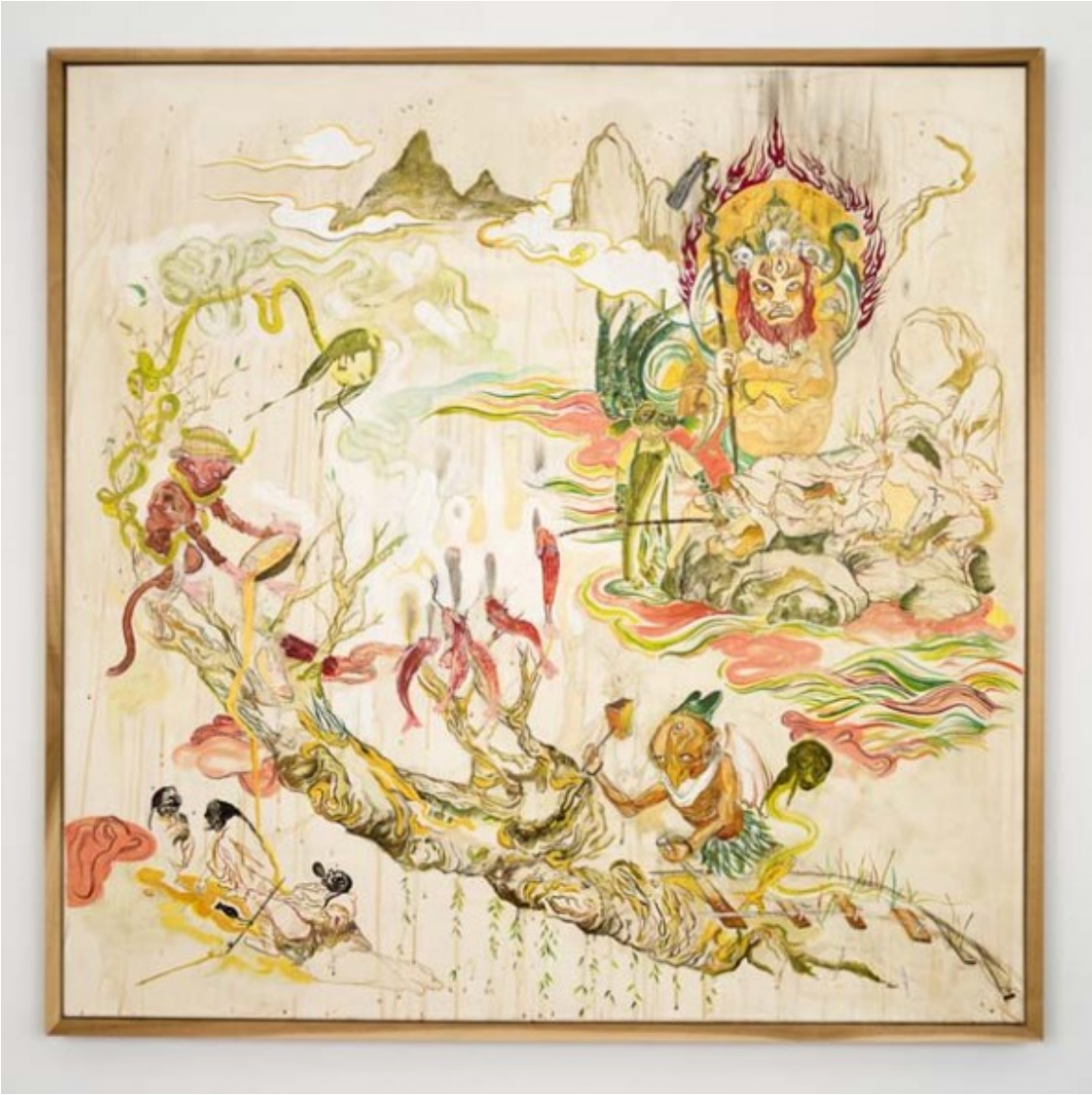
Howie Tsui, Celestials of Gold Mountain, 2013