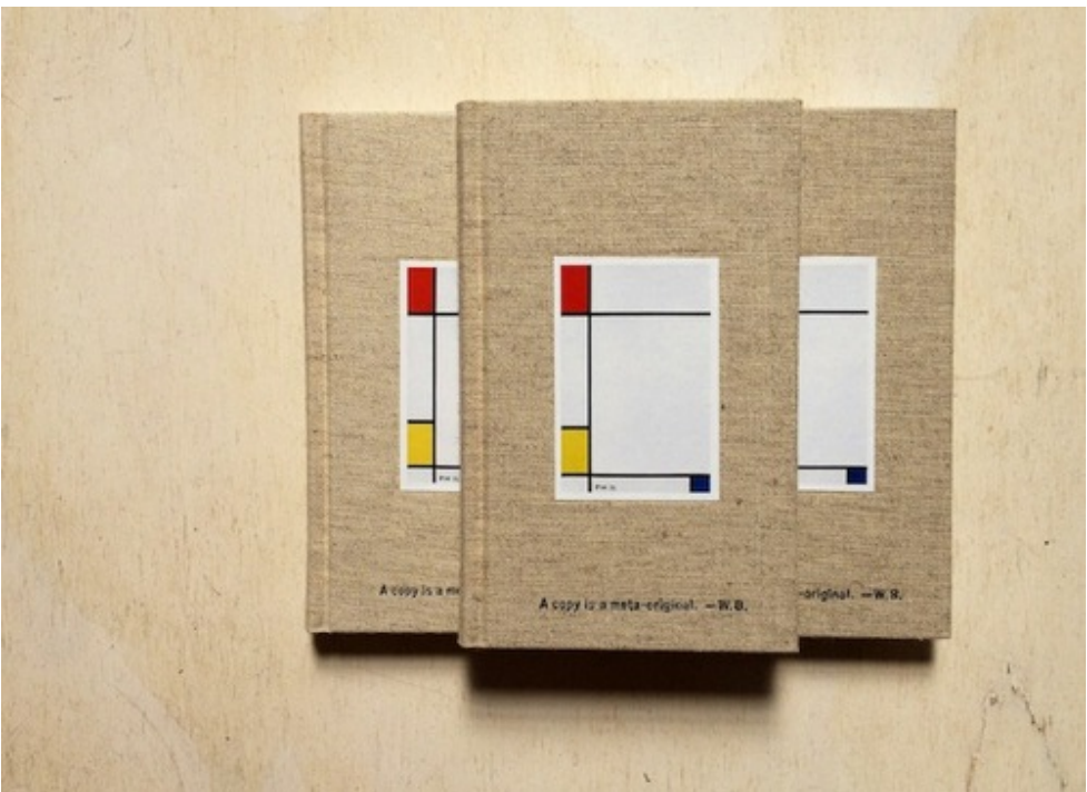
Walter Benjamin, Recent Writings, published by New Documents

Opening reception : tonight, November 8th, 7-9pm