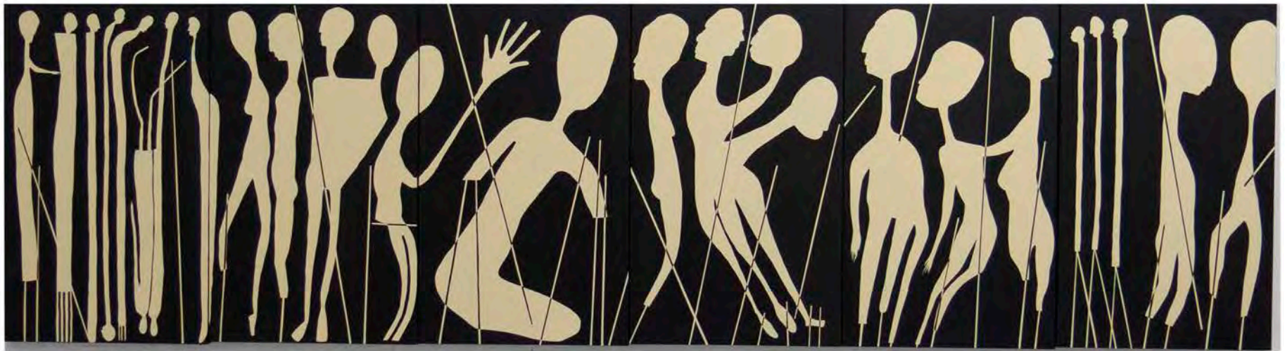
Lyse Lemieux Six Days in an Hour, 2022 CONFIGURATION 3