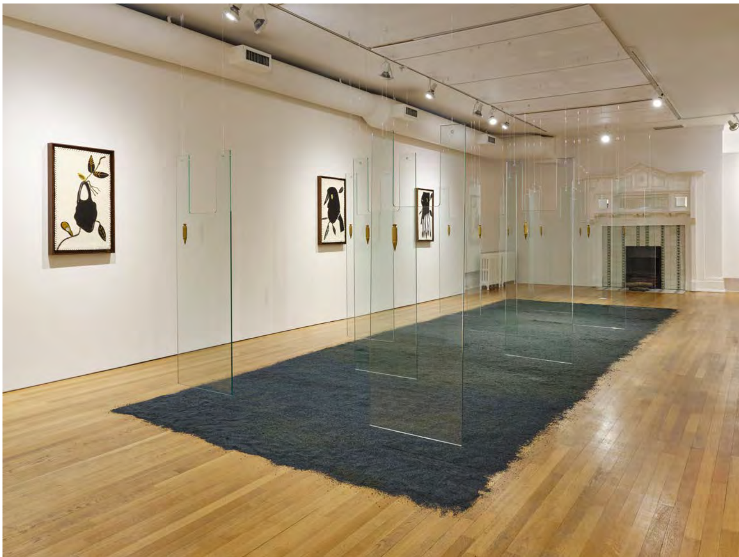
Celestial Drawings: Stations of the Child series

Presented at the Burnaby Art Gallery, 2021, as part of Lyse Lemieux's installation The Classroom/La Salle de Classe , 2021 (approx) 30'L x 5'W (914.2cm x 152.4cm), Glass, brass plumblines, monofilament, green sweeping compound